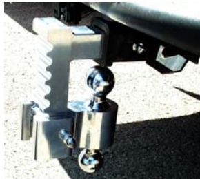
(Model 3410 Only)

Just as simple as that, and you are ready to go!!