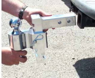
Install Rapid Hitch into the Receiver (down configuration)

We strongly advise the consumer and operator to learn the ratings of the various components of the towing system and to NOT exceed the limits of the lowest rated component.