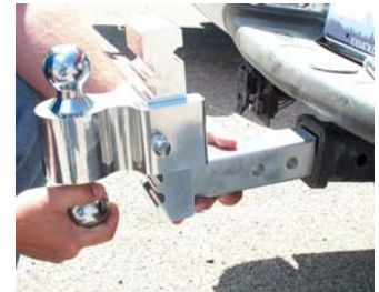
Install Rapid Hitch into the Receiver (upward configuration)